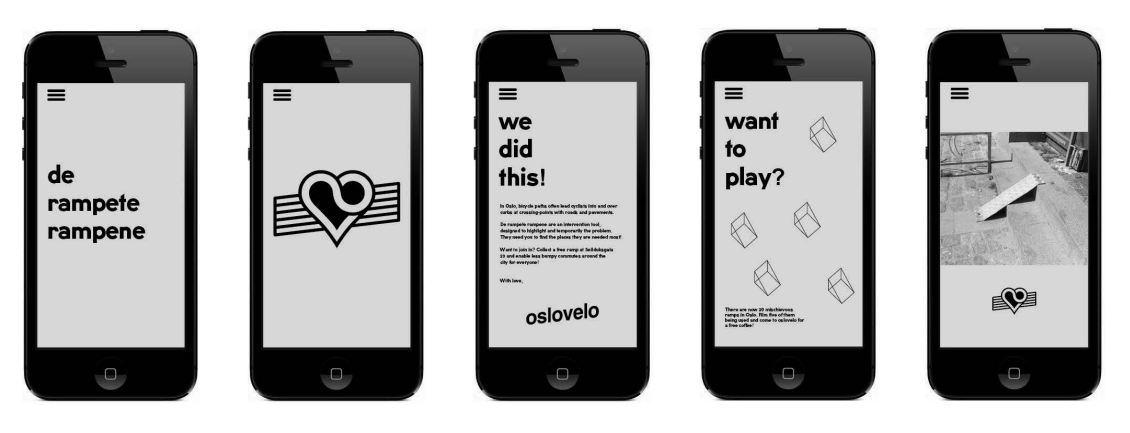
Figure 4. APP which explains Rampete Ramps and give additional stimuli for use and further development