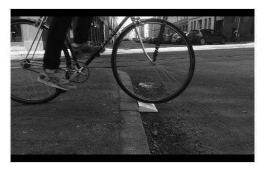
Figure 3. Rampete Ramps in use