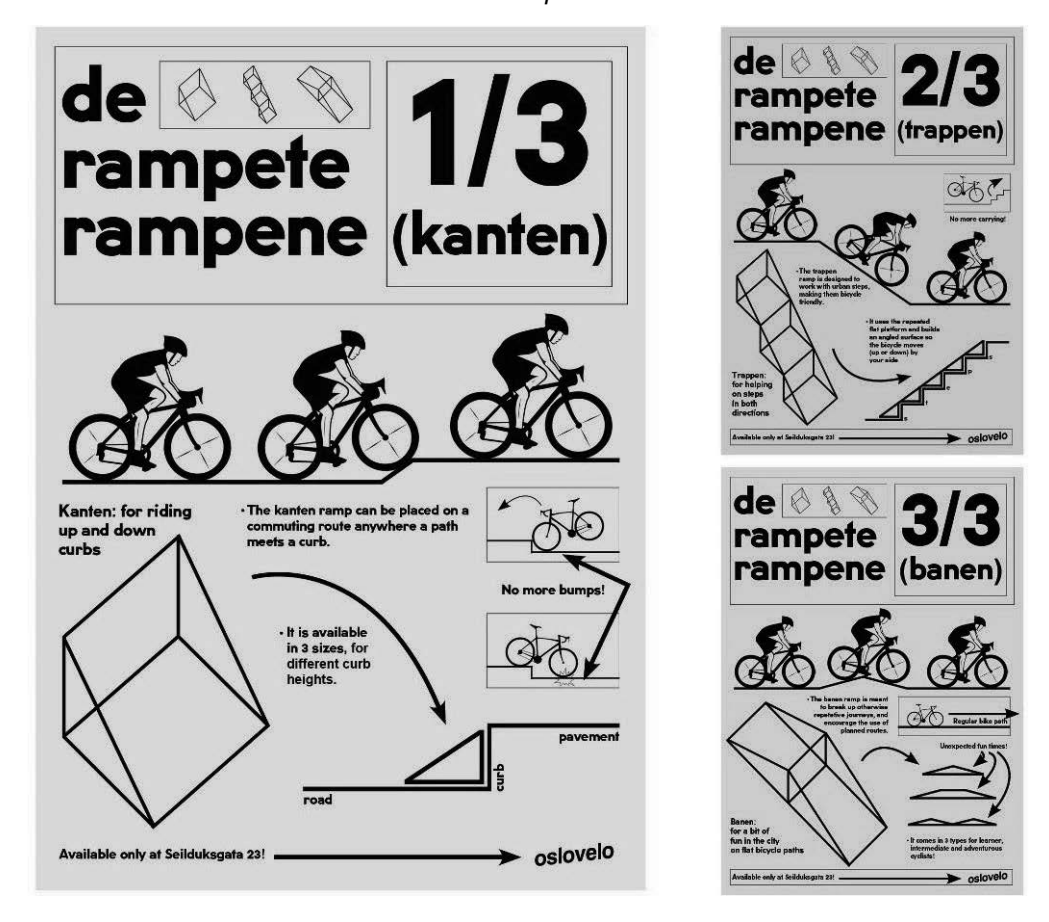
Figure 5. Priming and information posters for Rampete Ramps by James Duncan Lowley