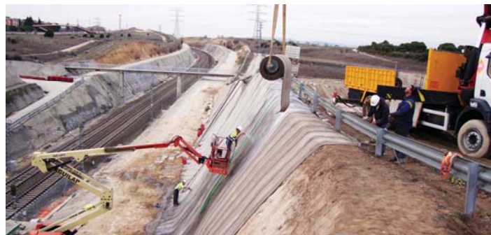
Figure 1. Concrete Canvas used for slope lining