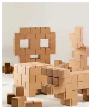
Figure 3. GIGI BLOKS, Creative Business Cup 2014, 2nd place, Designer Ilona Viluma

GIGI BLOKS is a set of oversized building blocks to foster children`s creativity [11]. The product idea is based on the childhood dream of the GIGI designer to have gigantic blocks for building houses. A few years ago designer wanted to give a present to her daughter, but large, ecologic and environmentally friendly blocks were still not available. The main values of the product are development of children's creativity, spatial and logical thinking, problem-solving experience and communication skills. [12]