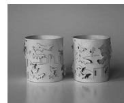
Figure 3. The firms' design presented by student at design exhibition

Reflections on awareness towards observation and active listening (Category 2):