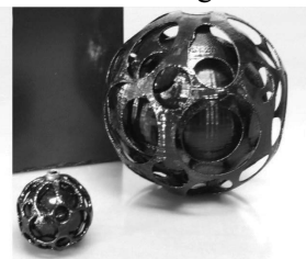
Figure 2. This student work was created using dissolvable scaffolding

However, the limitation with basic machines, such as the Up! is that as the support material is the same as the print material, the scaffolding will restrict what the student can create. Internal