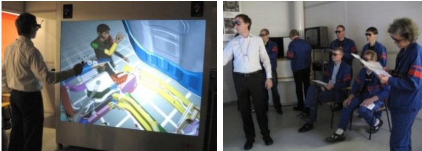
Figure 2: SE Team with moderating consultant in planning the assembly sequence virtually

Production Technology was responsible for informing the team about the requirements and possibilities of the manufacturing equipment and prepare the alternative calculations of them if needed.