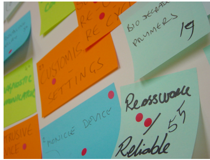
Figure 1. CPS Word Association