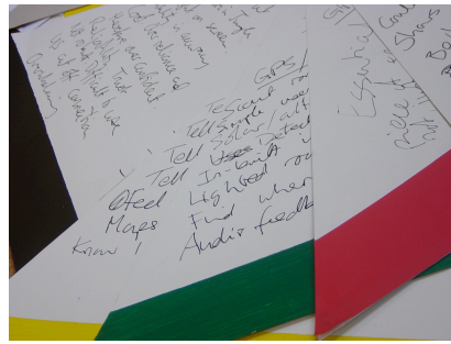
Figure 2. Six Hats