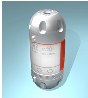
Figure 4. Final Design - Cardiff

Using industry standard CAD/CAM hardware and software, the final design (figure 4) soon took shape in the virtual environment. Designers, engineers and a CAD operator developed the product in real time, recommending appropriate manufacturing processes and design details that would ensure cost effective production and sustainability and commercial success. Anodised aluminium was selected with components exploiting a number of traditional processes including extrusion. For sustainability, it was decided that, as the main unit had longevity, the unit would embrace sustainability by enabling software upgrades rather than changes to the hardware.